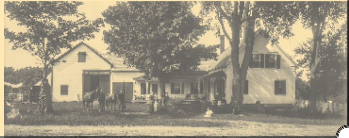
The Wentworth house, on East Main St.

smallboat shop Daniel Eaton 394 Hio Ridge Road Denmark, ME 04022 207-452-2687 info@smallboat-shop.com Wyonegonic Camps Steve Sudduth 215 Wyonegonic Road Denmark, ME 04022 207-452-2051