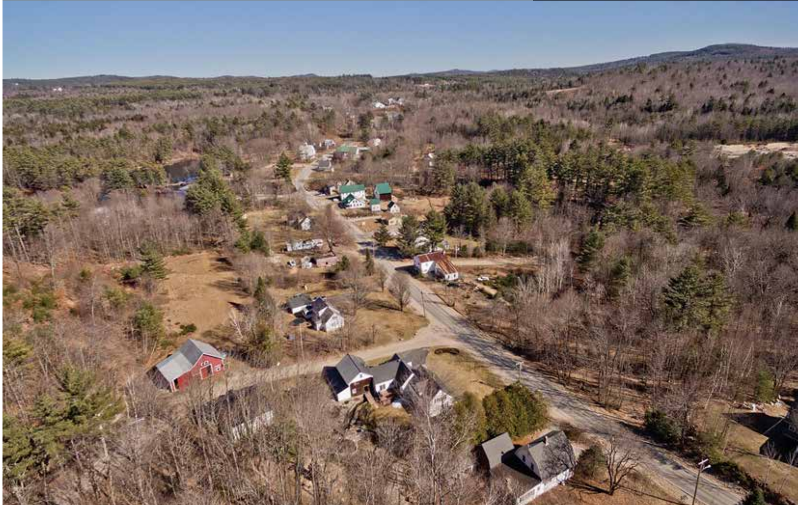
View of Denmark village, by Michael Berube.