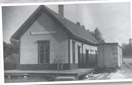
The Community Forest includes the site of the Perley's Mills Station.

Information from Loon Echo Land Trust and Northern Forest Center. www.loonechlandtrust.org ❄️