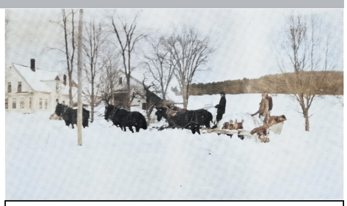
About 1920's. Building in the background is 366 Bull Ring Road. Belonged to A.I. Pingree in 1858 and O.I. Pingree in 1880. Recently the Morris's.

Snow rollers were used in the late 1700s but mostly from the 1880s into the 1930s, when automobiles were in more common usage. In some New England states the