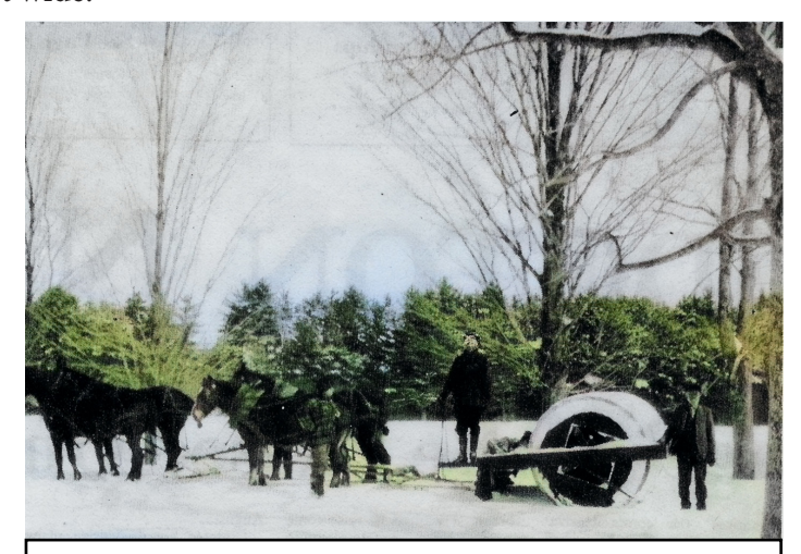
In 1923, snow rollers were used to keep the winter roads open. Arthur Sanborn is driving with Ingalls behind the roller, the gentleman besided the rear horse is not identified.

There were often two men up on the roller's seat and two "swampers" walking along beside the roller with shovels in case they were needed to break up drifts ahead. Five to six miles, depending on conditions, was a long haul. Stopping at farms along the way to change teams and have a hot drink or hot meal was common practice. Rolling the roads was a real community effort. Winter was a time when residents had more time to visit each other without the farming chores, and many activities were planned in the town's neighborhoods such as dances, sings, readings and general socializing.